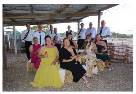
10 Dozen Oyster—Cowell Oysters

The committee are so proud of the event we put together but are so grateful for ALL the support they received from both Cowell, Kimba and the wider community.