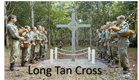
Long Tan Cross

On the 18th of August 2023, we commemorated the 50th anniversary of the end of Australia's involvement in the Vietnam War. Australians are encouraged to honour and remember the service of some 60,000 Australian men and women who served in the Vietnam War and their families—523 Australians lost their lives in the war, and over 3,000 were wounded. The flag was flying at the cenotaph as a mark of respect