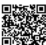
3 rd Home Game – Saturday 24 th June v Ports Magpies