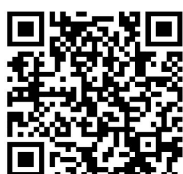
2 nd Home Game – Saturday 20 th May v Central Eyre United