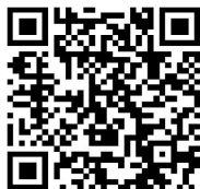
Thursday Night teas from 6 th April to 6 th July

If you are on Facebook, jump on the Cat's Chatter page to see all the updates and information as we move into the 2023 season.